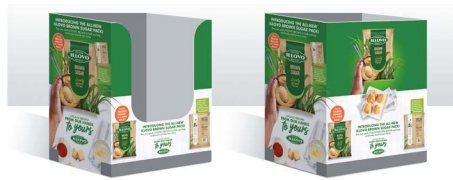
SUGAR PALLET MOCKUP